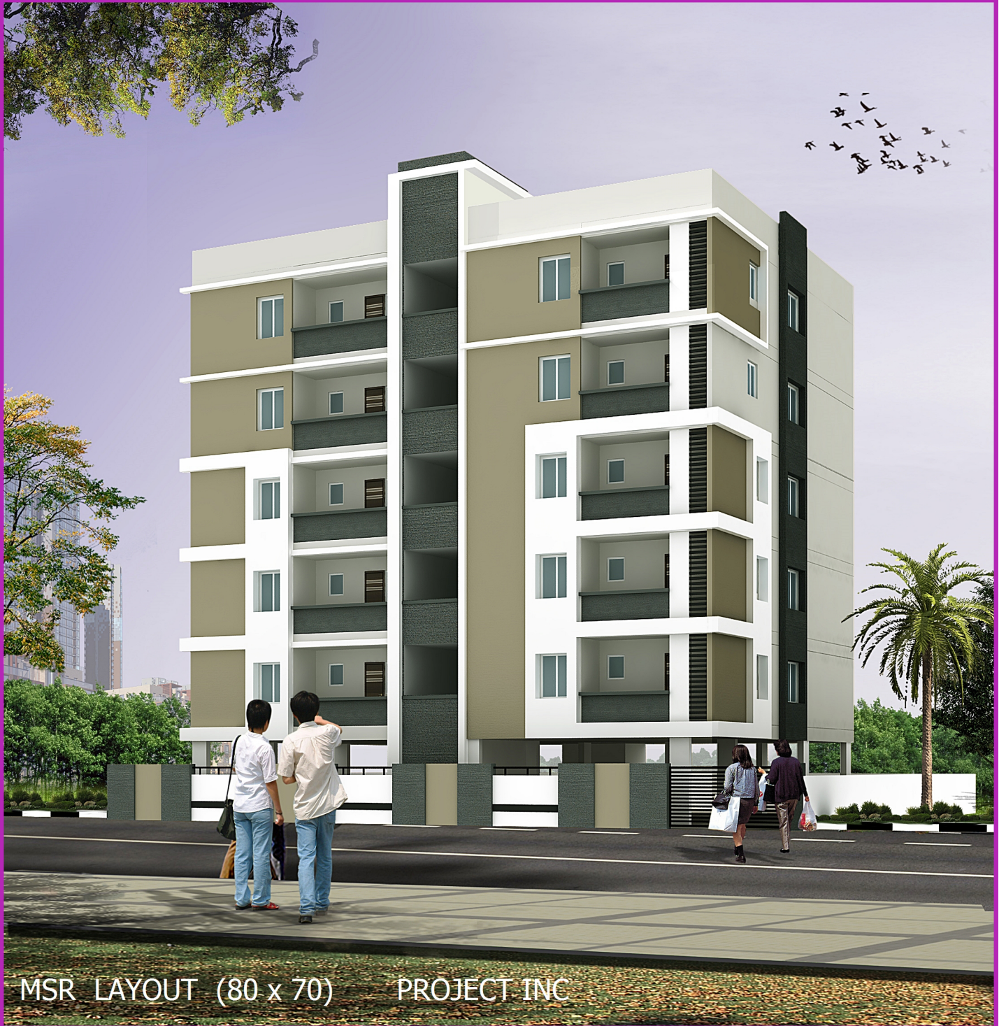
MSR LAYOUT (80 x 70) PROJECT INC